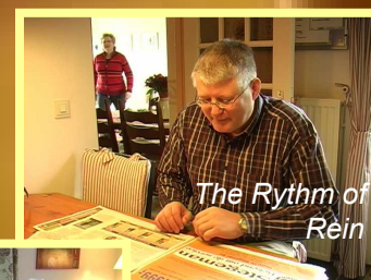
The Rhythm of Rein